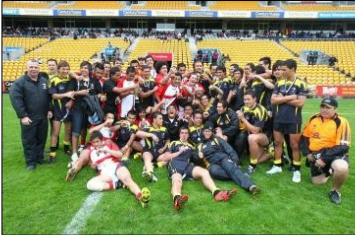
Nathan Cayless Cup Winners Counties Manukau 15s