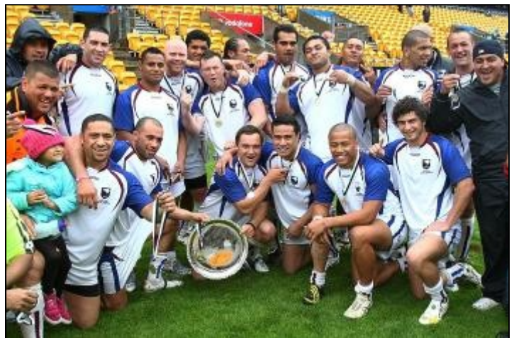
Albert Baskerville Trophy Winners Auckland Premiers

INTEGRITY | RESPECT | LEADERSHIP | COURAGE | PASSION