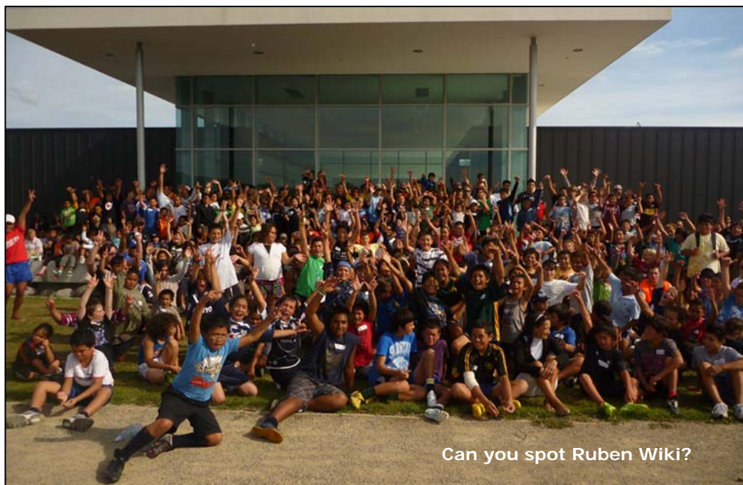
Can you spot Ruben Wiki?

The day was filled with activities providing an opportunity for any child aged between 6 – 15 years to participate, with the bonus of a chance to meet and work with their hero's.