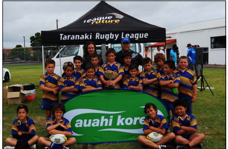
Winners: Te Pi'ipi'i Kakano mai i Rangiatea Kura Kaupapa

Te Pi'ipi'i Kakano mai i Rangiatea took out the tournament beating St Joseph's of New Plymouth convincingly.