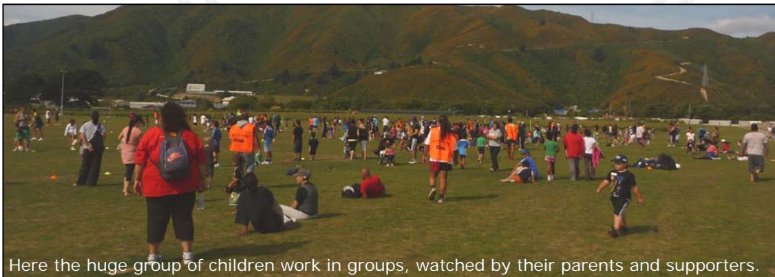
Here the huge group of children work in groups, watched by their parents and supporters.

The day was filled with activities providing an opportunity for any child aged between 6 – 15 years to participate, with the bonus of a chance to meet and work with their hero's.